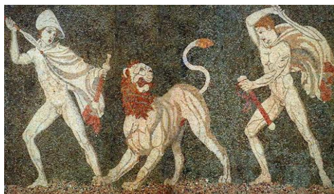
Mosaic from Pella