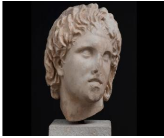
Head of Alexander the Great