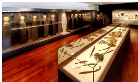
Archaeological museum of Pella